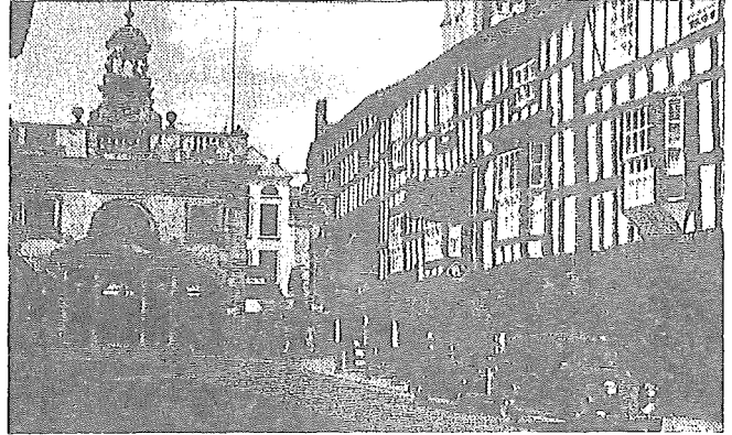
'AND LUDLOW CHIMES ARE PLAYING' Wilfred Pickles asks the people of the historic town to 'Have A Go' at 7.30